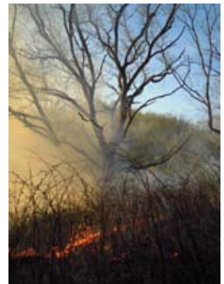
Prescribed burning at the Valley Ridge Preserve

Another spring activity was prescribed burning at the Valley Ridge Preserve near Richland Center, Wisconsin. We are gradually increasing the area burned each year to expand the preserve's restored savanna. In previous years the vegetation has been very wet, limiting the effectiveness of the controlled burns. However, this year we experienced very dry conditions, so the burns were quite lively!